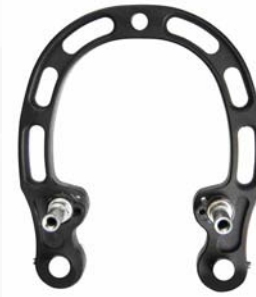
Brake Arch (1)